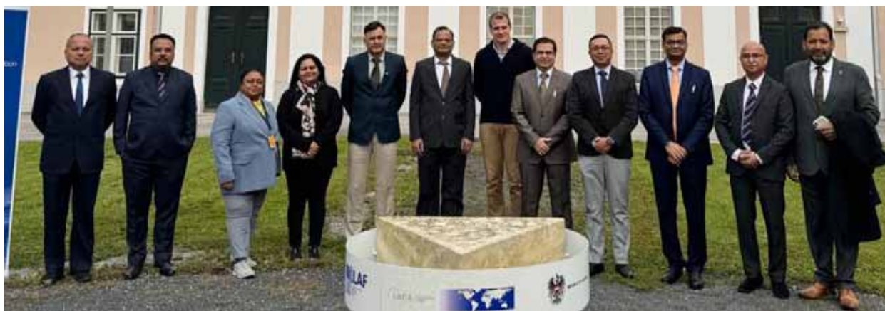
Indian officers attending (Third Batch) the Tailor Made Leadership programme on Anti-Corruption and Good Governance during 27 September - 4 October, 2025 at Laxenburg, Vienna, Austria.

Note: Faculty names are tentative and may change at the time of programme.