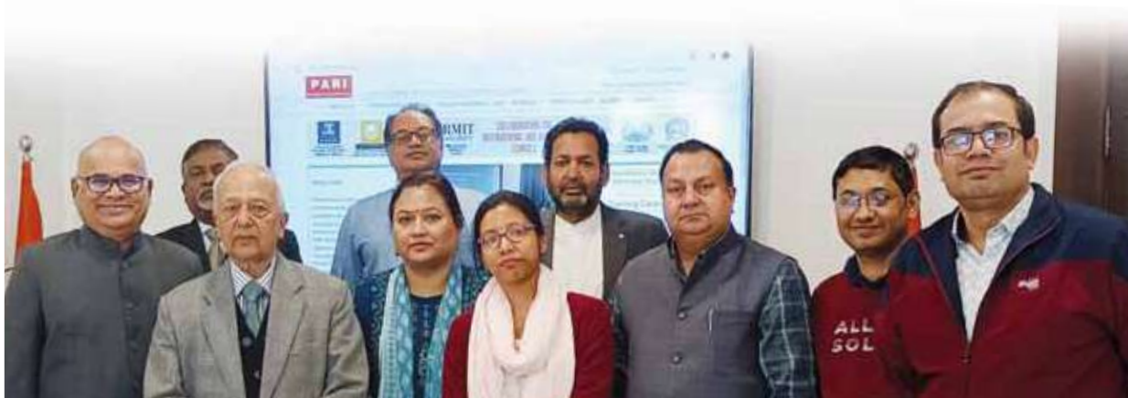
Indian officers attending (First Batch) the Tailor Made Leadership programme on Anti-Corruption and Good Governance during 4-8 March 2024 at Laxenburg, Vienna, Austria.