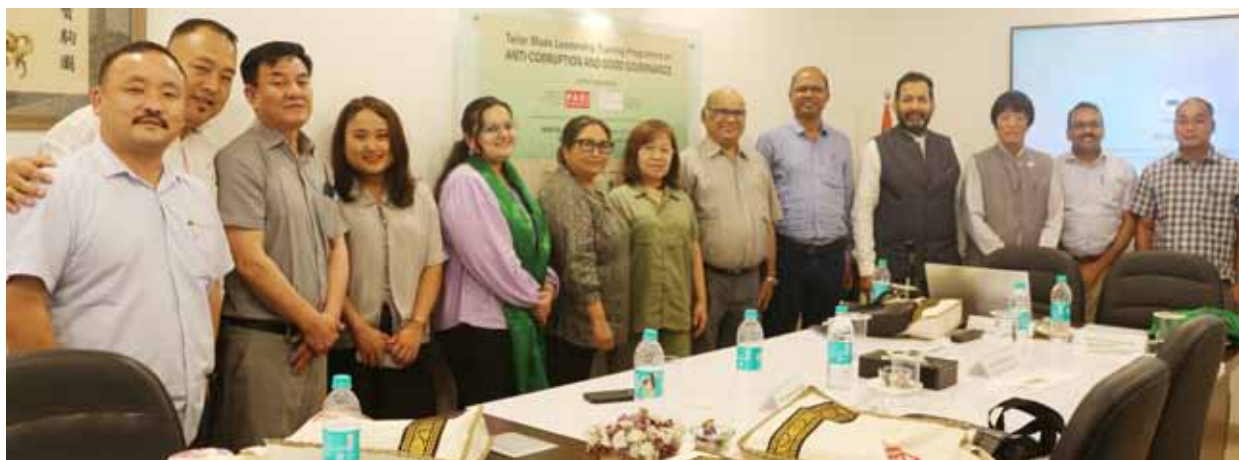
Indian officers attending (Second Batch) the Tailor Made Leadership programme on Anti-Corruption and Good Governance during 21-28 June, 2024 at Laxenburg, Vienna, Austria.

As corrupt practices are becoming more sophisticated, the "Tailor Made Leadership programme on Anti-Corruption and Good Governance" in the Era of AI developed by International Anti-Corruption Academy (IACA) will be able to address the above challenges, advise senior officials working in vigilance administration within public institutions and public enterprises of India on the latest developments, and give them the possibility to gain further insight on best practice examples and initiatives together with renowned international professors and practitioners.